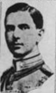
Crown Prince Umberto.

Consolidated Studios Are Swept by Flames Fatal to One—Master Pictures Burned Include Many New Talcott Productions.